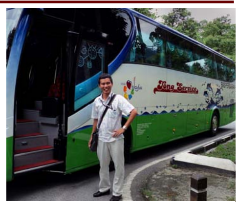
The pre-conference tour bus and guide.