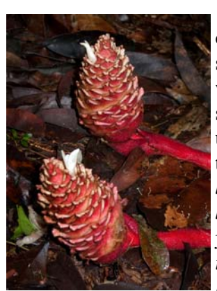
The unusual inflorescences of Zingiber longipedunculatum, Gunung Mulu National Park.

port. This time, for another short inland flight to Gunung Mulu National Park. This World Heritage Site is Sarawak's largest and arguably most famous national park. It is known for having an outstanding biodiversity, with over 3,500 species of flowering plants and an extensive limestone cave system. We checked in at park headquarters.