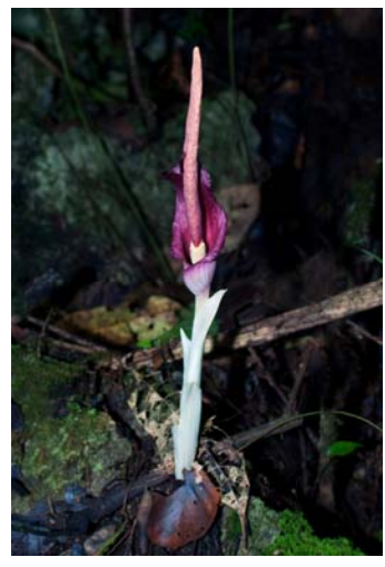
cence of fly-pollinated Amorphophallus julaihii.

After lunch, we proceeded on a leisurely walk along the scenic trails of Paku River, where we where able to observe a large assortment of unusual gingers growing in the wild, such as: Etlingera baramensis, Etlingera fimbriobracteata, Etlingera kenyalang, Hornstedtia tormentosa, Zingiber longipedunculatum, and the unique Amorphophallus julaihii.