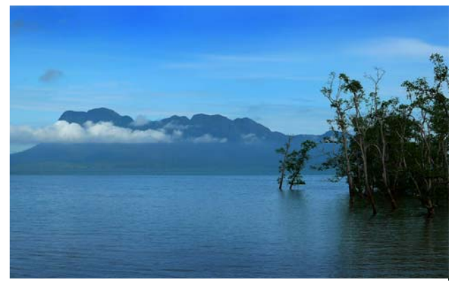
The beautiful view of the Gunung Santubong mountain from Bako National Park.

Early next morning, we headed to the coastal village of Bako, where Buntal Bay fisher-