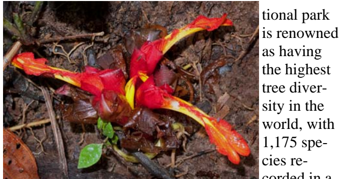
Etlingera coccinea inflorescence at the Lambir Hills National Park, near Miri, Sarawak, Borneo.

hiked for another three hours through virgin rain forest, saw several spectacular waterfalls, as well as endemic palms and herbaceous plants. Among these plants were: Etlingera coccinea, Hornstedtia reticulata, Hornstedtia leonurus, Plagiostachys crocydocalyx, Amomum coriaceum, Amomum gyrolophos, Tamijia sp. (an endemic species), Scaphochlamys sp., Boesenbergia sp., Amorphophallus sp., Homalomea sp., Nepenthes bicalcarata (a native pitcher plant), Musa campestris, and many,