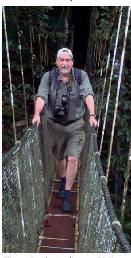
The author in the Canopy Walkway, Gunung Mulu National Forest, Sarawak, Borneo.

The next day, July 26th, we had another full day excursion up the Paku River Valley, into the foothills of Mount Mulu massif. There we where able to observe the impressive lowland forest, with towering emerging trees,