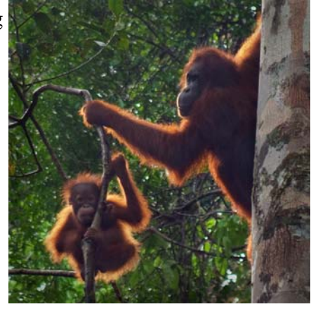
Bornean orangutans at the Semengoh Forest Reserve. "Orang-utan" means "forest people" in the Malay language.

their early morning feeding. It was very impressive to have been so close to these semi-wild animals, during their daily routine. On the way back, we visited the Taman Ethnobotanical Garden, full of exotic tropical palms. Later on, we had another two-hour hike