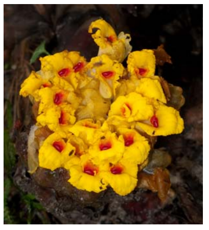
The brilliant yellow flowers of Etlingera fimbriobracteata, Gunung Mulu National Park.

By sunset we reached the entrance to the enormous Deer Cave. There, we where able to experience the unique spectacle of seeing huge swarms of thousands upon thousands of Wrinkle-Lipped Bats (Tadarida plicata), spiral out for their nocturnal foraging. We returned late in The foul-smelling infloresthe evening, fulfilled after having walked all day, to