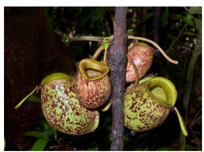
The pitcher plant (Nepenthes rafflesiana) growing in the Bako National Forest, northwestern Borneo.

(Johannesteijsmannia altifrons), and others. Bako's abundant wildlife impressed us. We saw the endemic proboscis monkey,