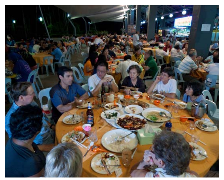
The group enjoyed excellent local food at the Top Spot Restaurant, Kuching, Sarawak, Malaysia.

A multicultural group of twenty individuals, from six different countries, participated in this year's HSI post-conference tour titled "The Botanical Treasures of Borneo". Ten of us had previously met, in 2008, during the last HSI trip to the heart of the Peruvian Amazon. This time, there were five Australians, five