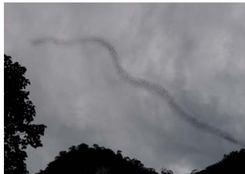
Hundreds of thousands of Wrinkle-Lipped Bats ( Tadarida plicata ) emerging from Deer Cave in a giant spiral formation.