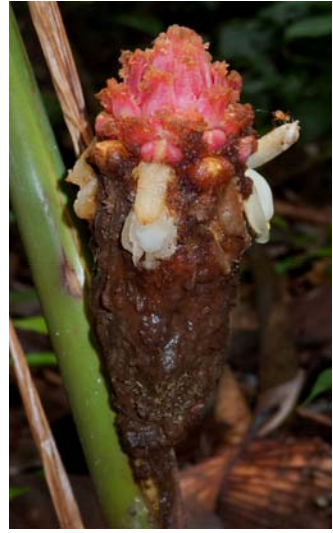
Plagiostachys crocydocalyx growing at the Lambir Hills National Park, near Miri, Sarawak, Borneo.

the highest tree diversity in the world, with 1,175 species recorded in a 52 hectare plot. After lunch, we