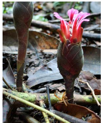
Inflorescence of Etlingera velutina var. longipedunculata in Park. This is the place Kubah National Park, Borneo.

On our first day (July 20th) of hiking, we visited Kubah National were 19th Century