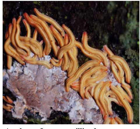
A colony of orange millipedes ( Pseudodesmus sp.) .

to Batu Bungan, a small Penan village, located along the Melinau River. There, we were met by members of the Orang Ulu tribe (known as the "long ear"), also meaning: upriver or interior