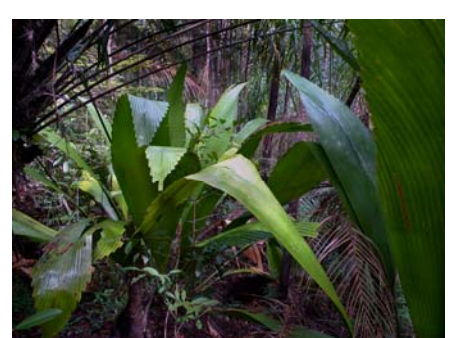
Lovely wild specimens of the Joey Palm (Johannesteijsmannia altifrons) in the Bako National Forest.