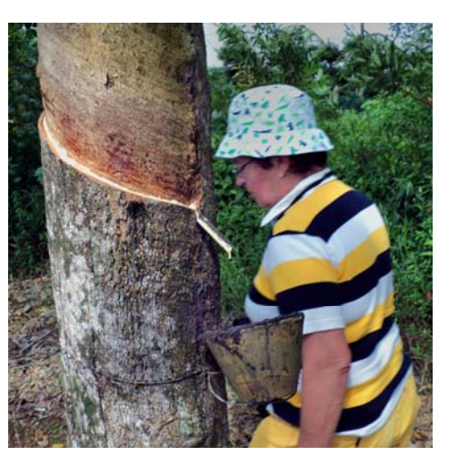
Rubber tree being tapped at the Forest Research Institute of Malaysia, in Kepong, Kuala Lumpur.

Since I was one day early, I had the opportunity to wander around the area and was surprised by the size of the city, its varied architecture