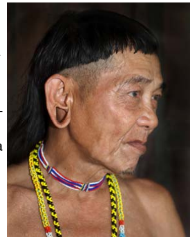
Elder of the Orang Ulu tribe.

Cave. There, a local guide was waiting and guided us through one of the most spectacular cave chambers in the park. Later on, we had lunch next to the Clearwater Cave, where some of our folks had a refreshing swim in the crystal-clear cold waters emerging from under the mountain.